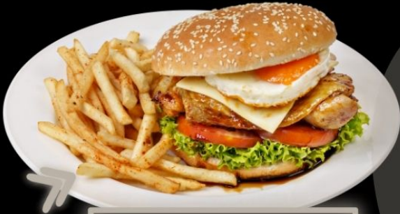
DA BURGER BOMB GRILLED TERIYAKI CHICKEN BURGER