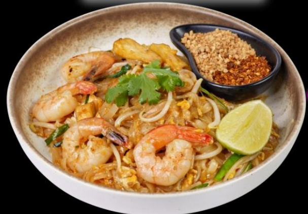
PRAWN PAD THAI STIR-FRIED RICE NOODLES

*CHICKEN / SEAFOOD LINGUINE TOSSED IN CREAMY THAI GREEN CURRY