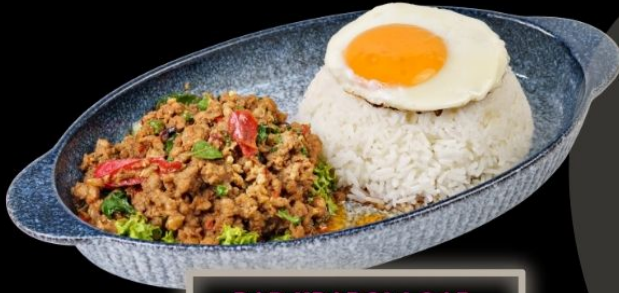
PAD KRAPOW GAI THAI BASIL CHICKEN