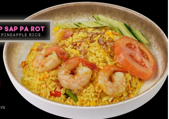
KHAO OP SAP PA ROT STIR-FRIED PINEAPPLE RICE

ALL PRICES ARE SUBJECT TO 10% SERVICE CHARGE AND 7% GST LUNCH SPECIALS CANNOT BE COMBINED WITH OTHER PROMOTIONS, DISCOUNTS OR VOUCHERS AVAILABLE FROM MONDAYS - THURSDAYS, EXCLUDING EVE OF PUBLIC HOLIDAYS AND PUBLIC HOLIDAYS