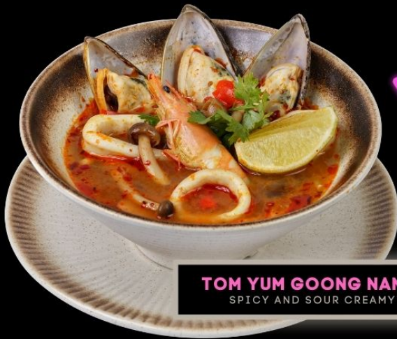
TOM YUM GOONG NAM KHON SPICY AND SOUR CREAMY SOUP

STIR-FRIED PINEAPPLE RICE WITH SPICES, PINEAPPLE, PRAWN, TOMATO AND CUCUMBER