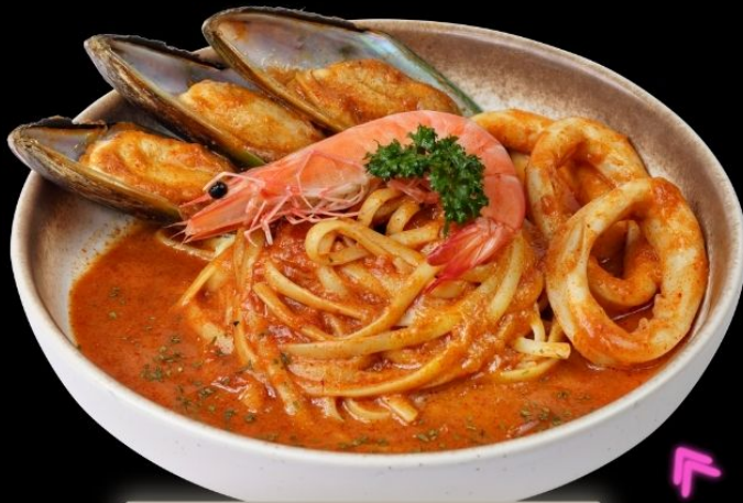
TOM YUM SEAFOOD PASTA SEAFOOD LINGUINE IN TOM YUM BROTH

FRESH PRAWN, SQUID, MUSSELS WITH LINGUINE SERVED IN OUR SIGNATURE TOM YUM BROTH